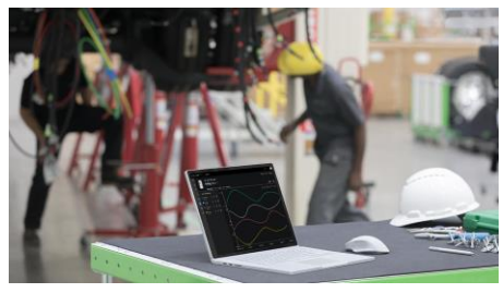
Connect your things to gather data