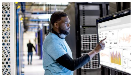
Intelligent action enables you innovate faster